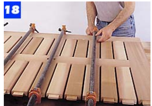
Clamp one stile at each end of the top subassembly. Space clamps evenly and at the center of a tenon.