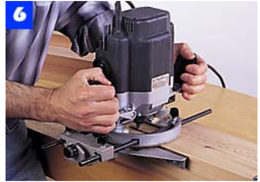
Using a spiral up-cutting bit in a plunge router, cut the table leg mortises. Two legs clamped together provide a stable base.

Rip and crosscut 1-in.-thick stock for the table and bench aprons as well as for the top frames and slats. Install dado blades in the table saw, and then use the miter gauge to guide the workpiece over the saw blades when cutting tenons ( Photo 7 ). Note that you can use the rip fence as a stop to gauge the tenon length. Since the tenons are 1 in. long, you need to make two passes to complete each cheek.