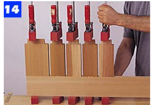
The first stage in assembling a benchtop is to glue and clamp slats to one stile. Use one clamp in the center of each slat.

Now move on to assembling the benchtops. Since there are several slats in each top, assemble each top in stages. First, glue and clamp the slats to one long rail ( Photo 14 ). After the glue sets on those joints, apply the opposite rail.