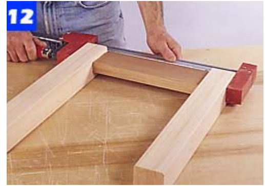
Glue and clamp together a pair of bench legs and one short apron. Make two of these subassemblies.

Assemble the table base in the same manner as the bench bases. Make two subassemblies consisting of a pair of legs and one apron. When the glue has set on these, join the subassemblies spanned by a pair of aprons.