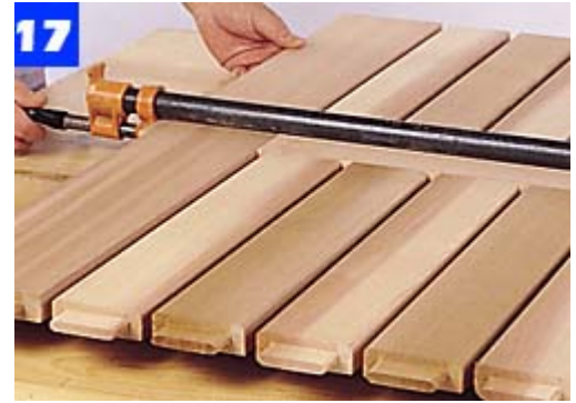
Glue and clamp a side rail to the center rail. One clamp, carefully centered, should provide enough force.

Invert the tabletop on a padded surface, then place the base over it. Adjust the base so there is an even reveal on all sides of the top, and then attach the base to the top with screws ( Photo 20 ). Assemble the benches in the same manner.