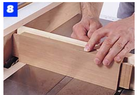
To cut the shoulders on a tenon, stand the apron up, and hold it firmly to the miter gauge. Butt it to the fence and make the cut.

Cut the tenons across the width of each workpiece, then adjust the blade height and move each workpiece over the blade on edge to cut the shoulder ( Photo 8 ). Clamp each workpiece upright in a vise and gently round over the tenon's edges using a wood rasp ( Photo 9 ).