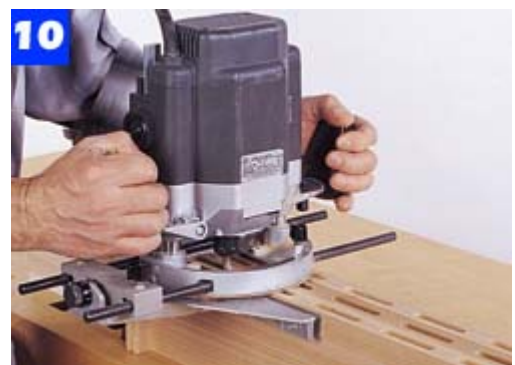
To cut the long row of mortises in each stile and rail, clamp three of the workpieces together to support the router.