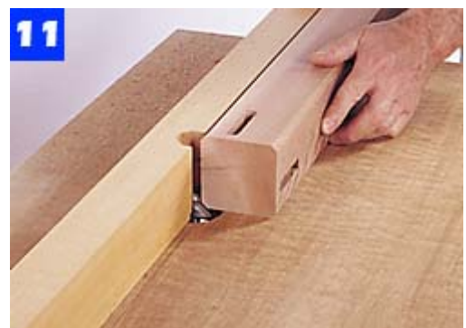
Use a chamfer bit in the router table to cut the chamfer on all four edges of the legs for the benches and table.