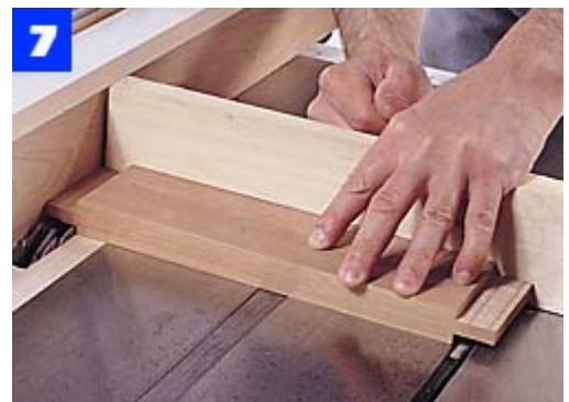
Use a dado blade setup in the table saw to cut the tenons on the apron pieces. Butt each apron to the fence, and make the cut.

Rip and crosscut 1-in.-thick stock for the table and bench aprons as well as for the top frames and slats. Install dado blades in the table saw, and then use the miter gauge to guide the workpiece over the saw blades when cutting tenons ( Photo 7 ). Note that you can use the rip fence as a stop to gauge the tenon length. Since the tenons are 1 in. long, you need to make two passes to complete each cheek.