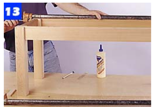
Join two leg-apron subassemblies spanned by a long pair of aprons. Glue and clamp this to complete a bench base.