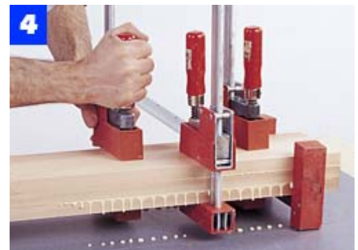
For the bench legs, spread glue on 3/4-in.-thick stock. Lay disposable material under the pieces and clamp them together.