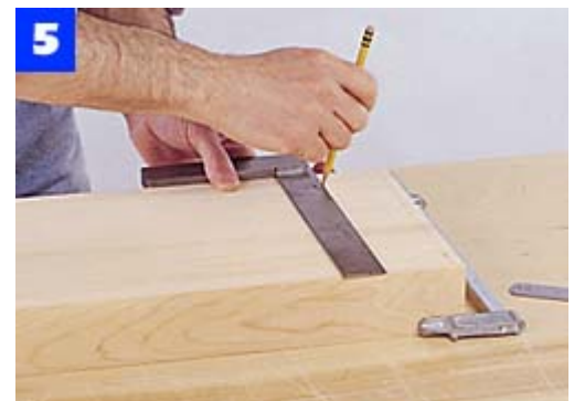
Rip and crosscut the individual bench legs to size, and then clamp them together. Mark out mortise locations on the legs.