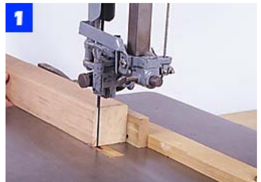
Rip the table leg stock out of a cedar 4 x 4. Clamp a temporary rip fence to the band saw table to do this.

The table legs are cut from 4 x 4 stock (or they can be glued up from thinner material). When using 4 x 4 stock, cut each leg to rough length. Next, clamp a fence to the band saw table, and rip the blanks to a 2 3/4 x 2 3/4-in. square ( Photo 1 ). Then clamp the leg to a workbench, and use a razor-sharp plane to remove the saw marks ( Photo 2 ). Unless you are very experienced with a hand plane, check the workpiece frequently as you go. The edges of the leg must remain square to one another. Remember that you are only smoothing the surface, so do not remove too much material.