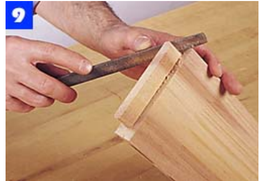
Round off a tenon with a rasp. The tenon's radius matches the radius left by the spiral up-cutting bit used to cut the mortise.

To complete the part-making process, install a chamfer bit in the router table, then use it to cut the 3/16-in.-deep chamfer on the table and bench legs, aprons and top parts as shown in the plans (Photo 11) . Note that not all edges are chamfered.