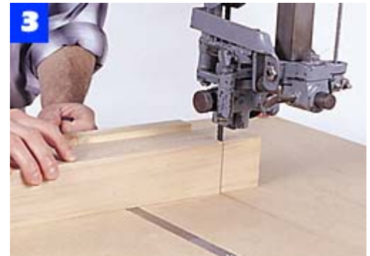
Crosscut the legs on the band saw. Here, a shopmade crosscutting table and a miter gauge are used to make the cut.

Clamp a table leg to a benchtop and remove saw marks with a hand plane. To make a smooth cut, push the plane at an angle.