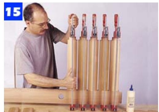
Multiple subassemblies are made in assembling the tabletop. First, slats are joined to the center rail.

Approach the tabletop assembly in the same manner. Begin by gluing and clamping a slat at each end of the center rail. Fill in between these two slats with more slats ( Photo 15 ). When the glue is dry on this subassembly, glue and clamp slats to the opposite side ( Photo 16 ). Next, glue and clamp the side rails to this subassembly ( Photo 17 ). When the glue is set on that subassembly, position clamps across it and then glue and clamp one stile to it ( Photo 18 ). Complete the top by gluing and clamping the second stile.