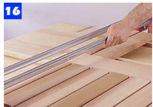
A second set of slats is glued and clamped to the center rail. Again, use one clamp in the center of each slat.

Approach the tabletop assembly in the same manner. Begin by gluing and clamping a slat at each end of the center rail. Fill in between these two slats with more slats ( Photo 15 ). When the glue is dry on this subassembly, glue and clamp slats to the opposite side ( Photo 16 ). Next, glue and clamp the side rails to this subassembly ( Photo 17 ). When the glue is set on that subassembly, position clamps across it and then glue and clamp one stile to it ( Photo 18 ). Complete the top by gluing and clamping the second stile.