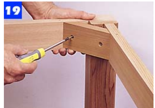
A corner block is installed at each leg on the table and the benches. A pair of screws holds each block to the aprons.